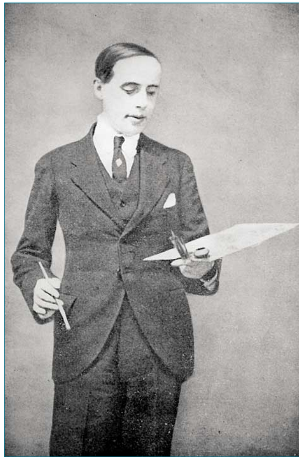
Einar Wegener, 1929.