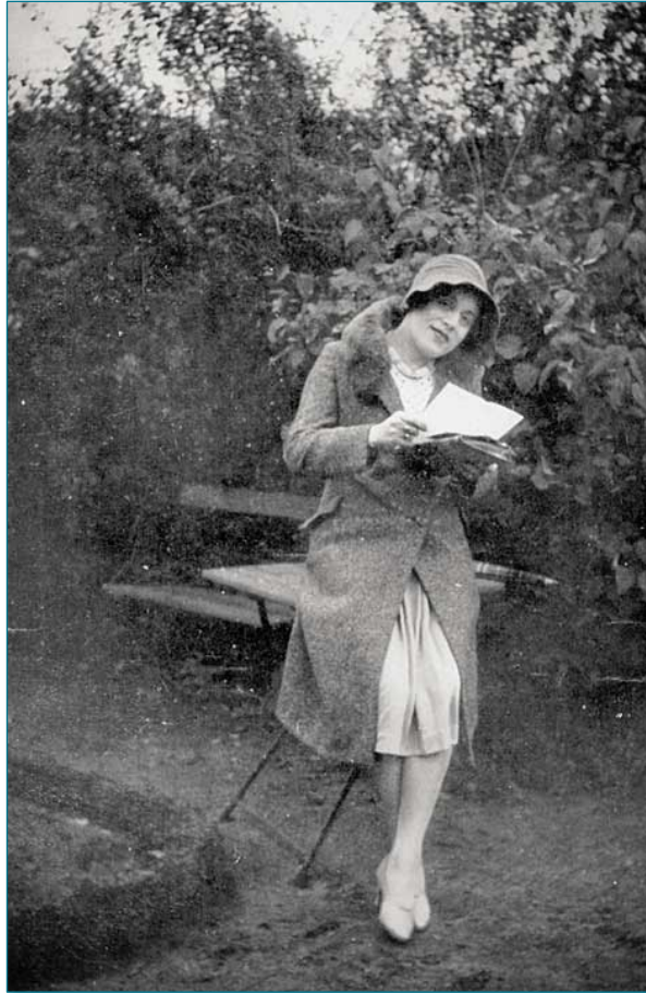
Lili Elbe, Copenhagen October 1930.

In the style of the time, the translation's name was long – Man into Woman: An Authentic Record of a Change of Sex: The true story of the miraculous transformation of the Danish painter Einar Wegener (Andreas Sparre) .