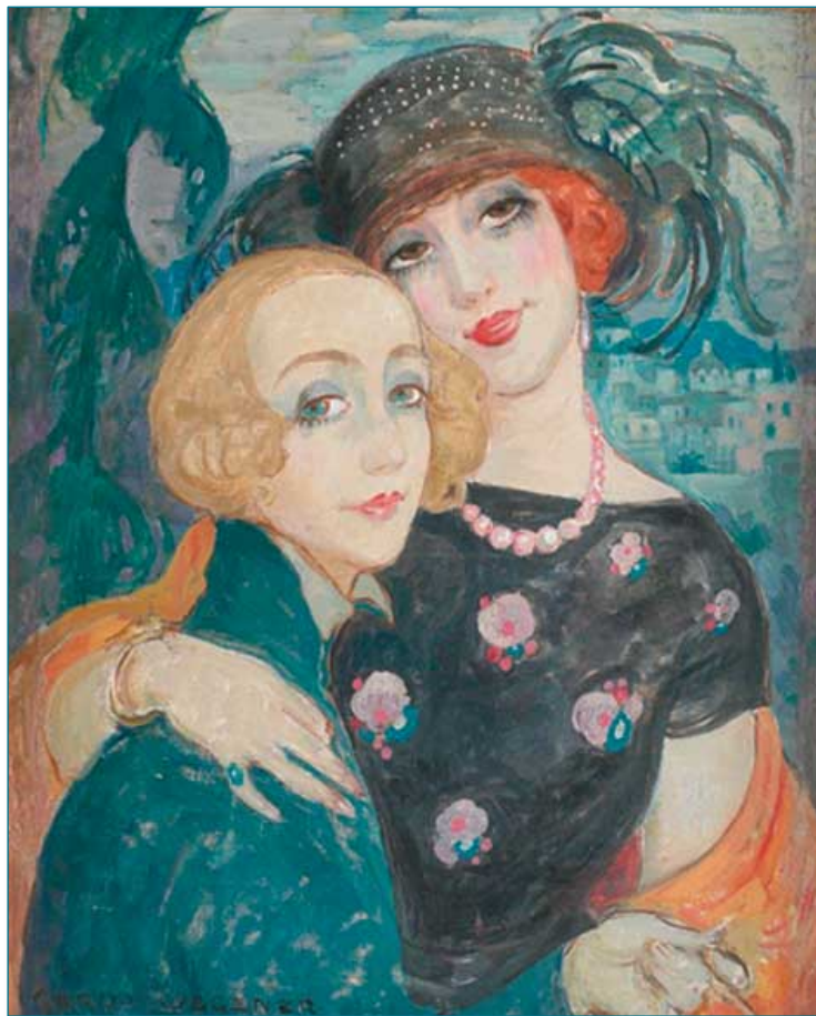
Gerda and Lili, painted by Gerda Wegener.

Einar, though considered the more talented, came to put Gerda's career above his own, to the point of eventually becoming his wife's favourite model, as a woman. It seems that he was often taken for a young woman dressed in men's clothes as he went about his business in the city of Paris.